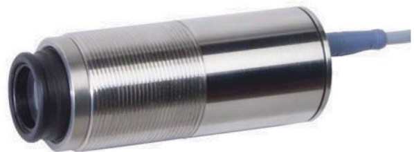
Polaris -Infrared Switch in stainless steel housing